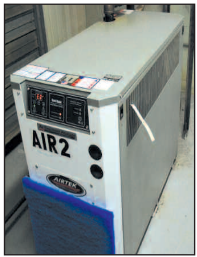
GARDNER DENVER AIR COMPRESSOR