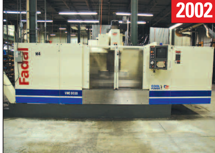
FADAL CNC VERTICAL MACHINE MODEL VMC8030 HT