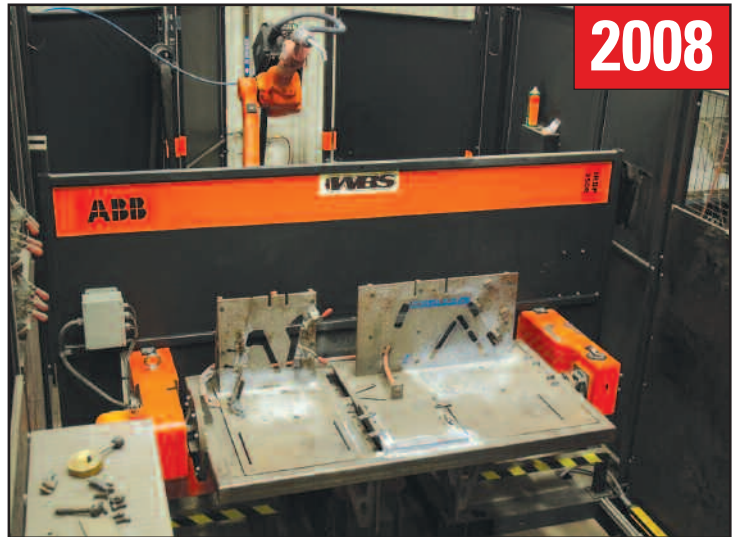
ABB ROBOTIC MIG WELDING CELL