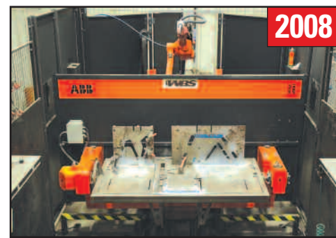
ABB ROBOTIC MIG WELDER