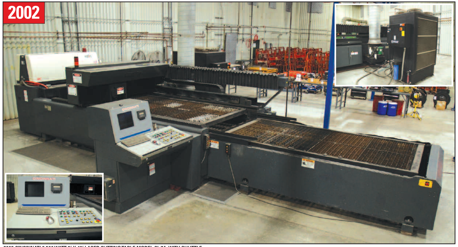
2002 CINCINNATI 3,500 WATT 5' X 10' LASER CUTTING TABLE MODEL CL-7A, WITH SHUTTLE