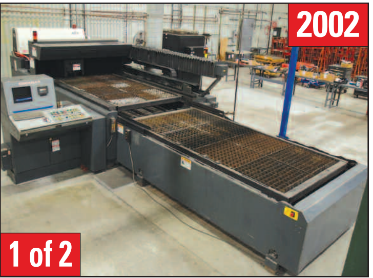
CINCINNATI CL-7A 5' X 10' LASER CUTTING TABLE

FEATURING: (2) CINCINNATI Laser Systems, (2) TRUMPF, PACIFIC and WYSONG Press Brakes, FADAL CNC, ABB Robotic Welder, SCIAKY Spot Welder, MILLER Tig Welders, WELDSALE Acorn Weld Table, VECTRAX, BRIDGEPORT and CAMTROL Mills, (2) PEMSERTER Insertion Machines, ENERPAC Press, SINGLETON, COM-TEN INDUSTRIES, WALTER and TOMCAT Support Equipment, GARDNER DENVER Air Compressor, AIRTEK Air Dryer, GORBEL Modular Crane System, ANVER Vacuum Generator Suction Lift & Much More!