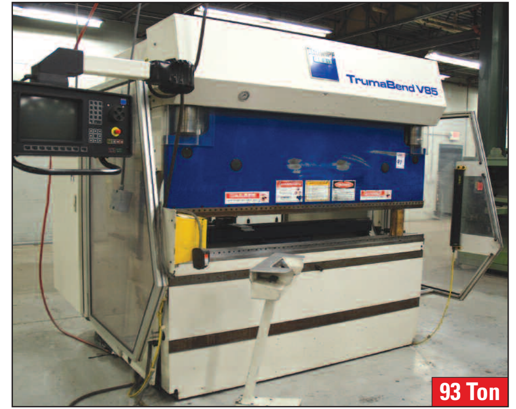
TRUMPF TRUMABEND 6.5' (80") X 93 TON, MODEL V85