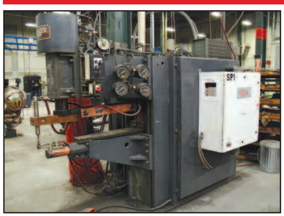
SCIAKY 150 KVA SPOT WELDER TYPE RM00.3STO-150-36