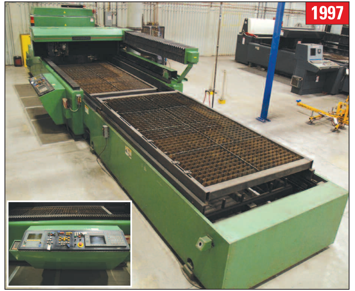
1997 CINCINNATI 2,000 WATT CL-7A 5' X 10' LASER CUTTING TABLE, WITH SHUTTLE

2002 CINCINNATI 3,500 Watt 5' X 10' Laser Cutting Table Model CL-7A, Pallet Changer, Rofin Laser Generator Model DC035/20 sn 16020000, Koolant Koolers Chiller Model HCV15,000PR-NF-FILT-H, 15 HP Compressor, sn 21326, PC Based CNC Control, Trico Mist Matic, Balston Oil Filter, Greenheck Dust Extraction Fan Model TBI-CA-3H20-20, sn 04F26034, 400V, sn 52677