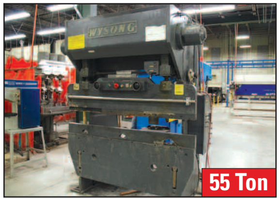
WYSONG PRESS BRAKE MODEL H-55-4