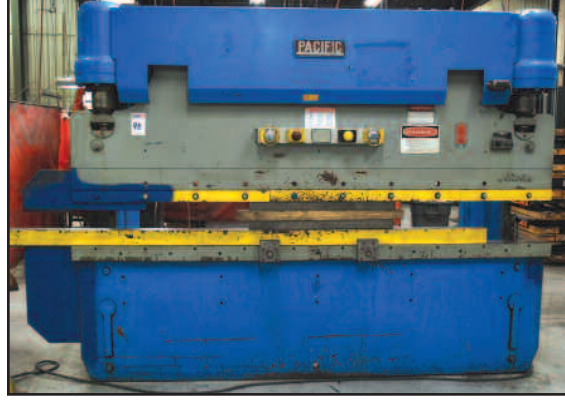
PACIFIC 10' X 90 TON (10 GAUGE) MODEL J SERIES J90-10