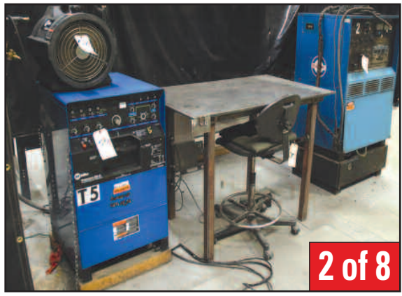
VIEW OF MILLER SYNCROWAVETIG WELDERS

SCIAKY 150 KVA spot welder Type RM00.3ST0-150-36. Upgraded Sciaky Digital control, 44" Throat, 440V,